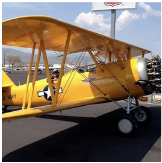
Naval Aircraft Factory N3N

The squadron has a 1941 US Navy N3N "Yellow Peril" biplane and a Cessna L-19E "Bird Dog."