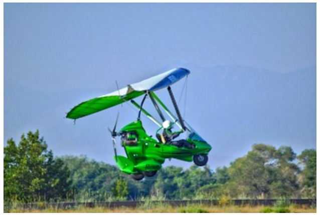
REVO Trike over Runway 27 at Carson City

As part of blowing out the cobwebs toward adding a Gyroplane Rating, I'm planning to take an intro lesson or two in Sport Aviation Center's REVO weight-shift "trike."