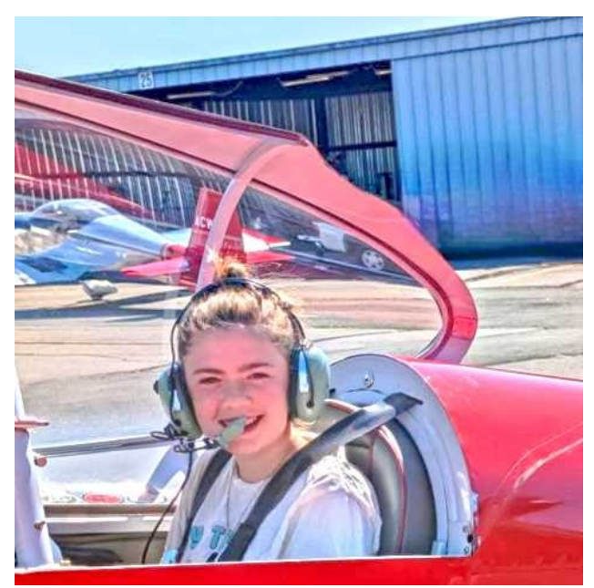
Juniper gets an impromptu flight.